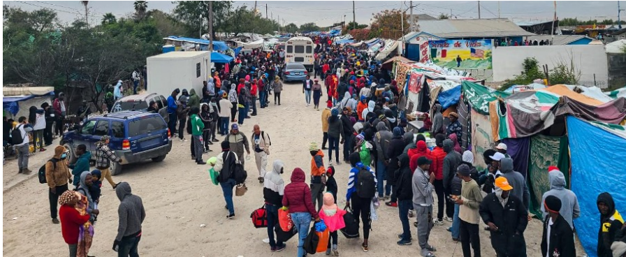
17 November 2022, Reynosa, Tamaulipas in Mexico, several thousand people wait outside one of the main shelters, Senda de Vida.